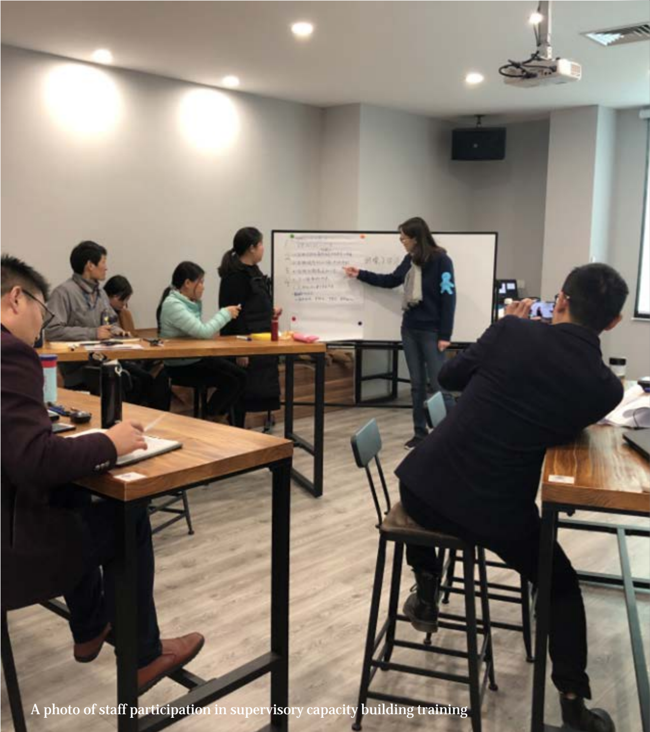
A photo of staff participation in supervisory capacity building training