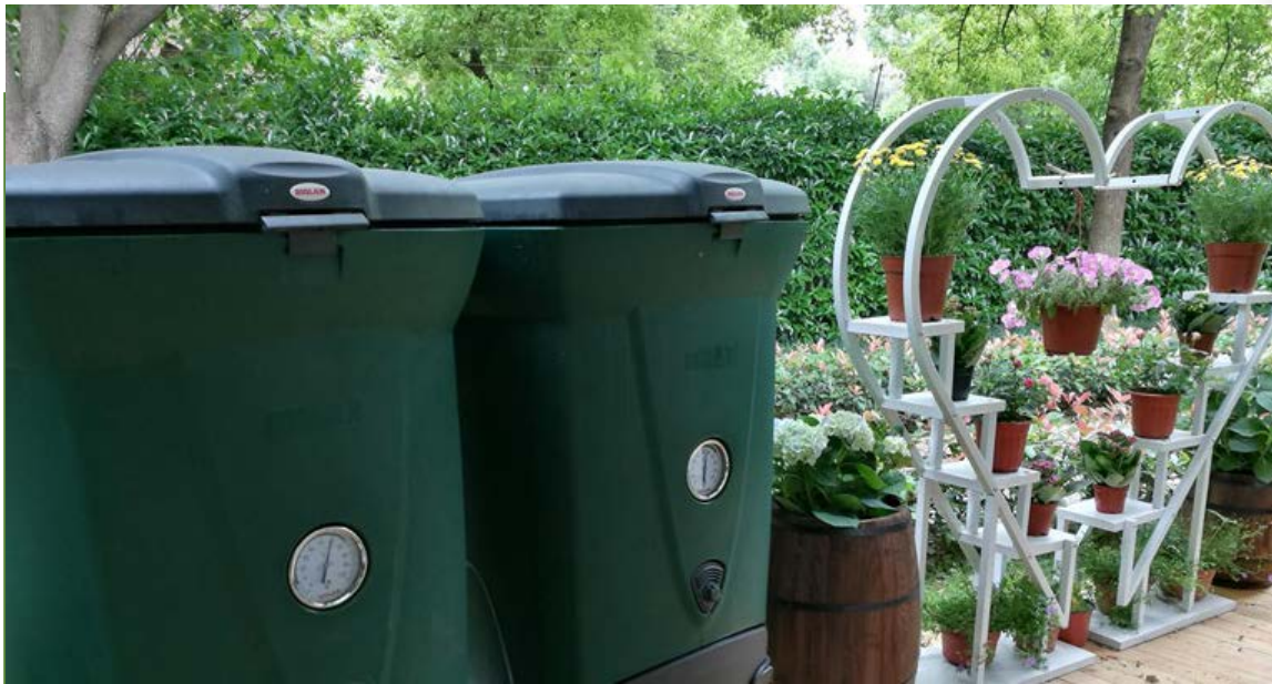
Yutai Jingyuan Parking Lot Community Composting Garden. Wet garbage becomes fertilizers for flowers after fermentation in fermenting barrels.

What can turn waste sorting from a “trouble” to a “duty”? How can the waste sorting trend become popular?