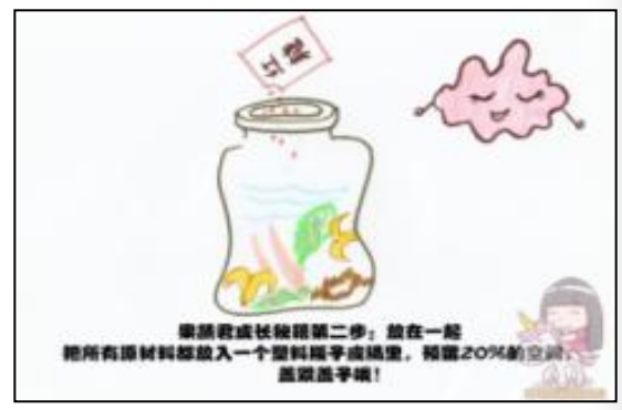
2.Put all ingredients in a tightly sealed container!