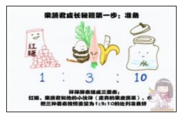
1.Brown Suger, Veggie/Fruit/Water in 1:3:10 ratio.