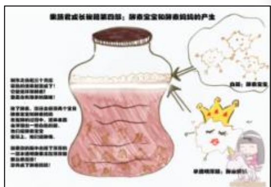
4.Ready to use in 3 months.